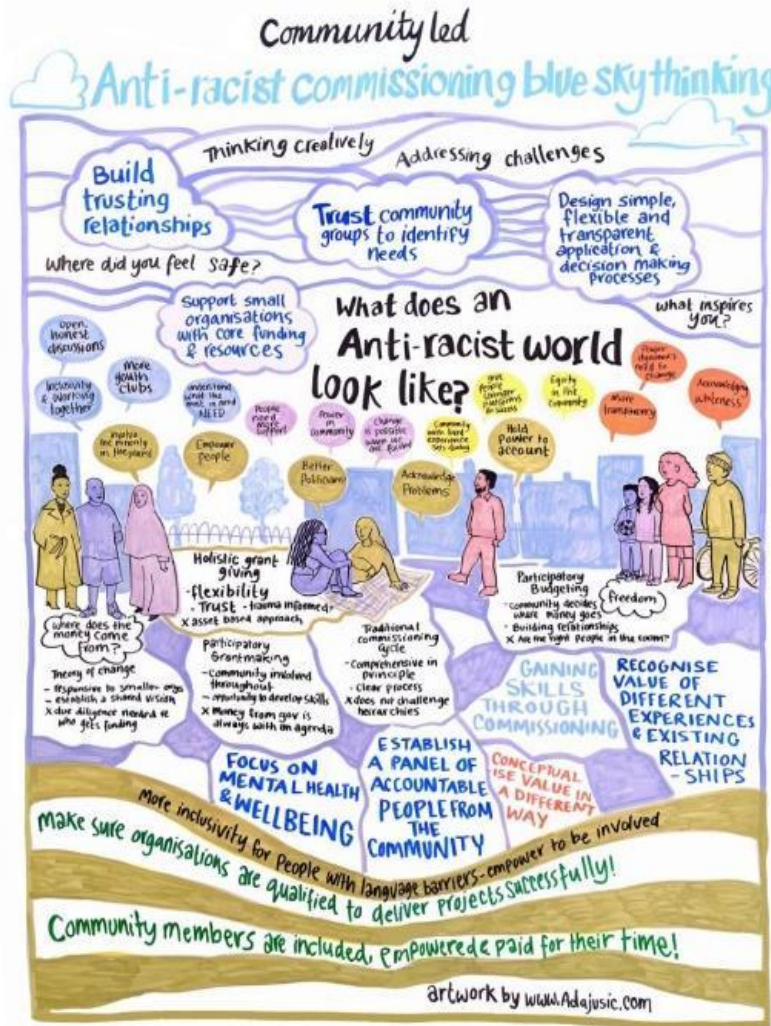
Figure 2. Anti-racist commissioning blue sky thinking session summary

Through several engagements, workshops and a blue-sky thinking event Hackney CVS, Statutory partners, VCS organisation and the communities of City and Hackney were able to identify a community priority (Young Black People's Mental Wealth) (figure 2) and design a commissioning process to test out the Anti-Racist Principles.