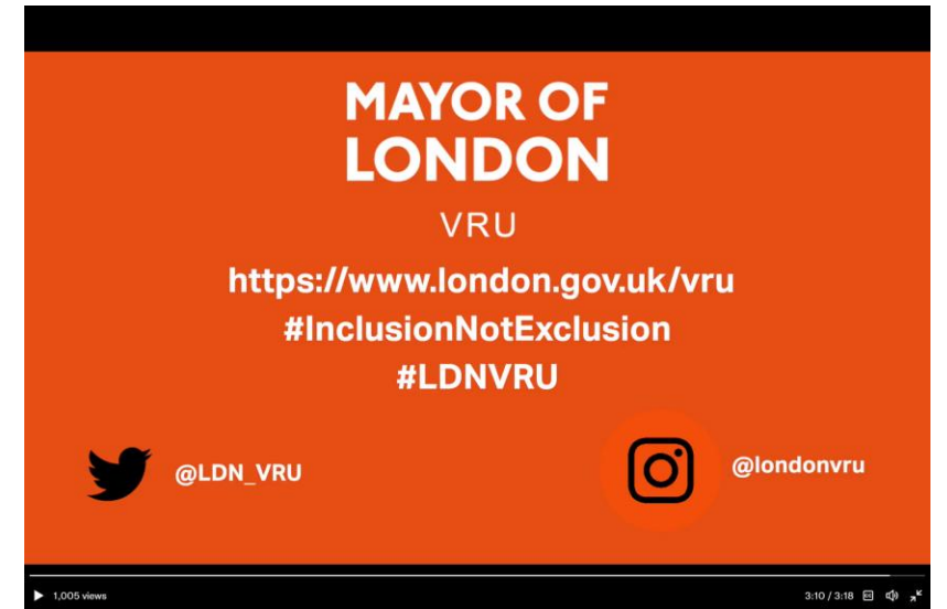
Violence Reduction Unit Education Summit - YouTube