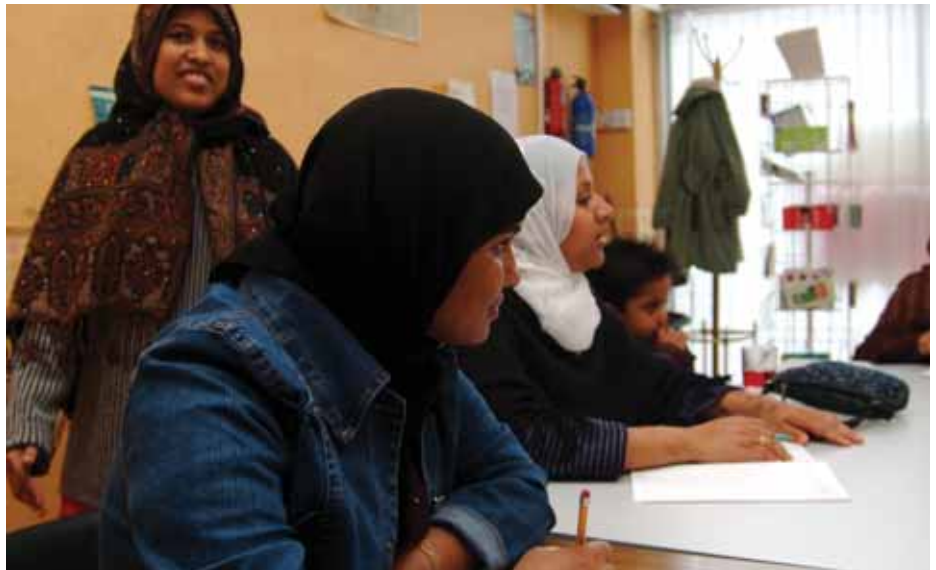
Women are likely to bit hard by ESOL cuts - Women learning at Hackney Bangladeshi Cultural Association