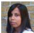
Popi Begum Reception - maternity leave