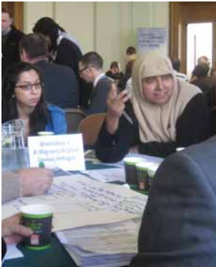
Round table discussions

Over 100 people joined Hackney Community Empowerment Network and Team Hackney partners last February for the event 'Future Planning for our Changing environment'.