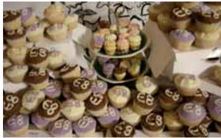
A feast at Hackney Hear launch