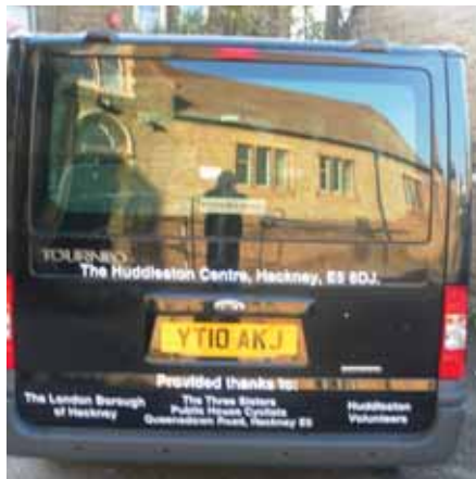
New Huddleston van!

and using your resources. It's hard because young people want an instant answer and we have to keep spirits up. The trip aimed to personally develop young people whilst giving back to the Nepalese community so we dug toilets for a village. Our focus is always the young people who come through the gates; if we go the extra mile we always get it back."