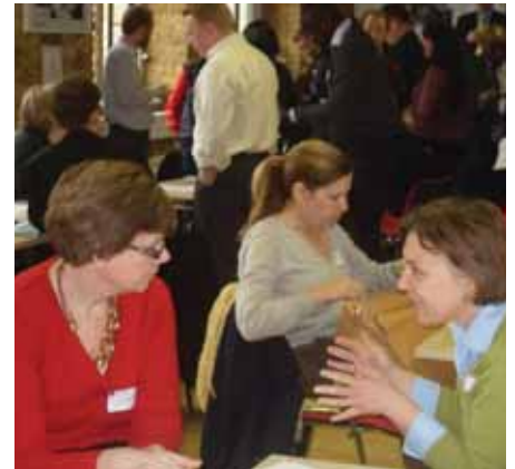
EDN's Funding Our Future

aspects of the programme. We will be working with Hackney Council on a longer term plan for VCS initiatives tackling Worklessness. Fairness is key to any contract and the EDN is committed to ensuring that all agreements of partnership working, subcontracting or 'spot purchasing' (where an organisation is paid for a particular service rather than as an end to end provider) reflect the value of the service provided. Look at our website for our June event for members to meet the three contract holders. ◆