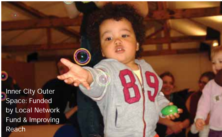
Inner City Outer Space: Funded by Local Network Fund & Improving Reach