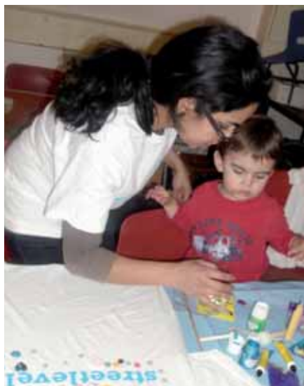
Printing T-shirts for the runners

The running event was funded by Hackney's Youth Opportunity Fund after a Street Level youth group came up with the idea and applied for funding. Street Level offered a free health check-up and training at the Britannia