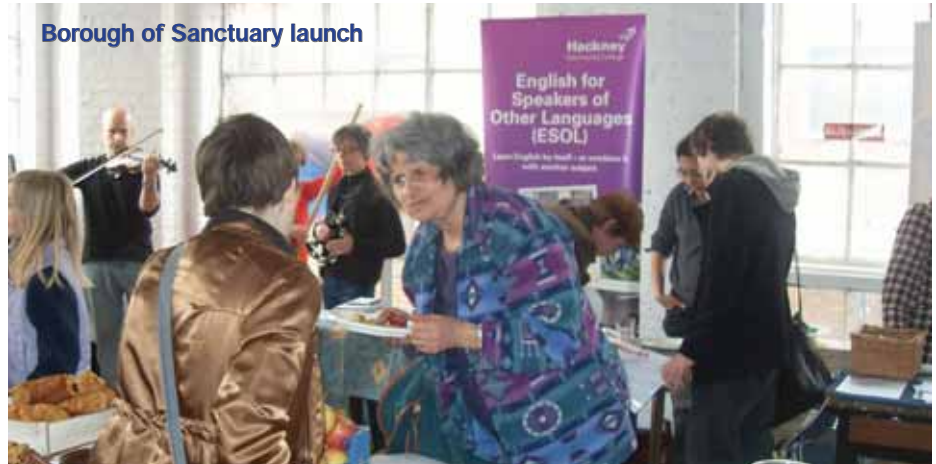
Borough of Sanctuary launch