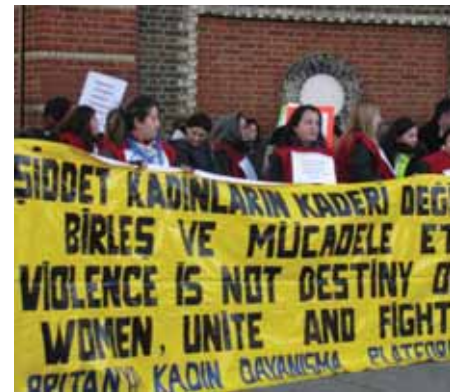
Demonstration against violence against women by the local Turkish and Kurdish community

📄: www.hackneycen.org.uk/resources/default.aspx