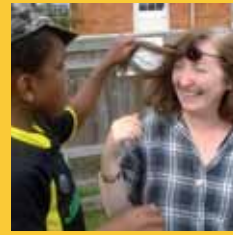
NEWS FROM THE SECTOR

Are you ready for the Commissioning game?