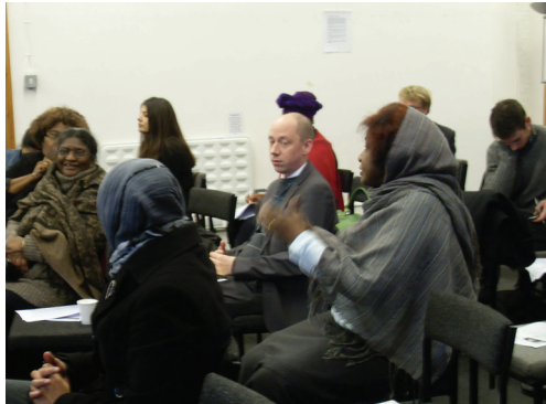
BEMWG AGM November 2010

However, this is happening while budgets are being cut. HCVS is funded to deliver training until February 2011 to help groups get ready but this may not be repeated. The Council are anticipating a lot of savings through Transformation as some service users will be managing their own care - see opposite.