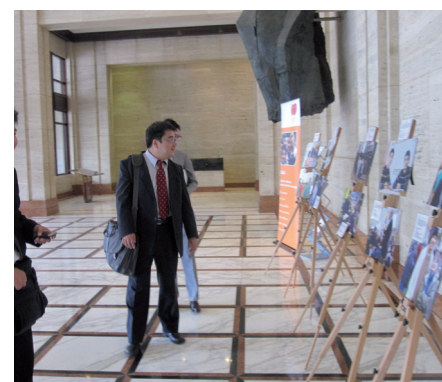
City slickers see the Changing Lives exhibition at 155 Bishopsgate