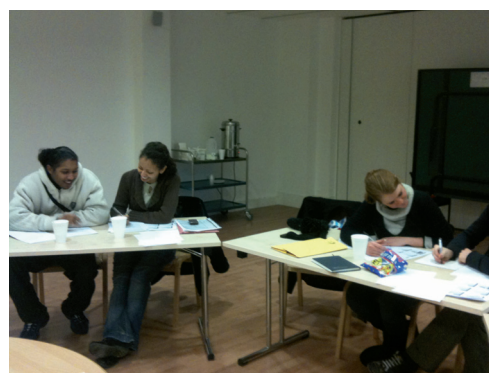
Young people gaining events management skills

Our most recent course kicked off last month, running one day