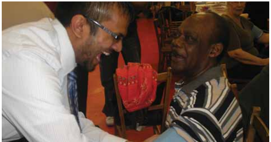
CAP: Community Health Day

Interested in renting desk space at HCVS? Contact Paul Conway ☎: 020 7923 8368 or ✉: paul@hcvs.org.uk