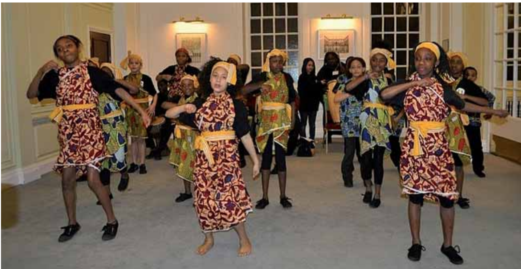
Sound and visual energy of Amberliegh drum and dance group