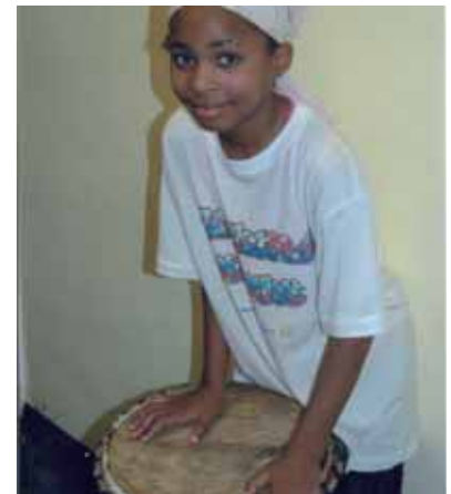
A young drummer

S PARK heard from Dolores Crump from Starburst Creative Play. Dolores celebrates 10 years of voluntary service in spite of having neurosurgery in 2005 and having since developed macular degeneration, an eye condition in 2009.