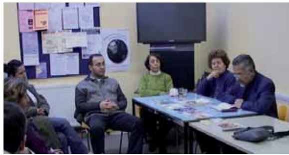
Day-Mer: Business and employment advice