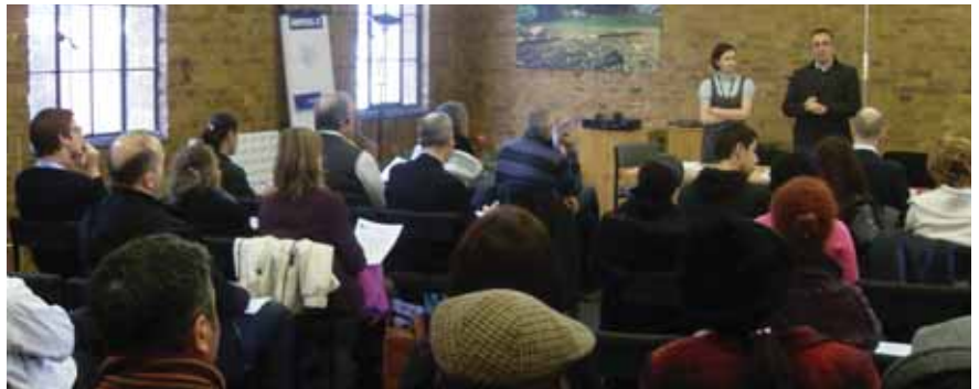
2012: A packed audience

H ackney Refugee Forum has teamed up with Onsite to raise awareness for local refugee and migrant communities about 2012 Olympics training opportunities.