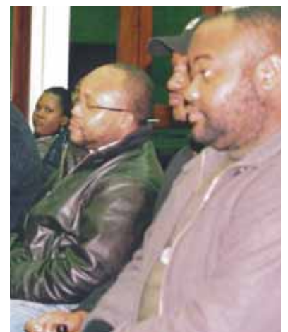
Francophone network launches

📞 Hackney Francophone Organisations Network ✉: sosfamilies@aol.com