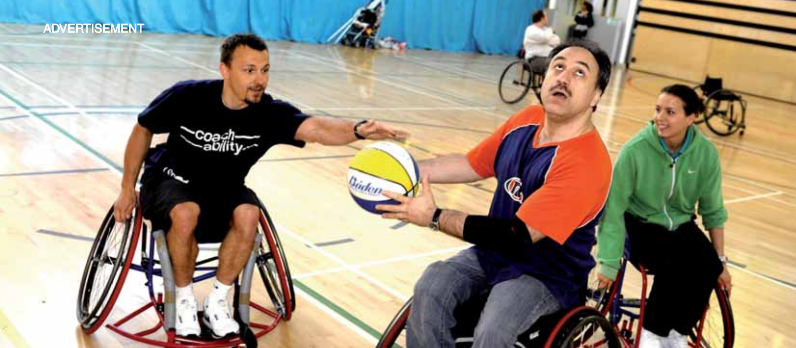
2012 funding support for Hackney Sparrows Wheel Chair basketball team