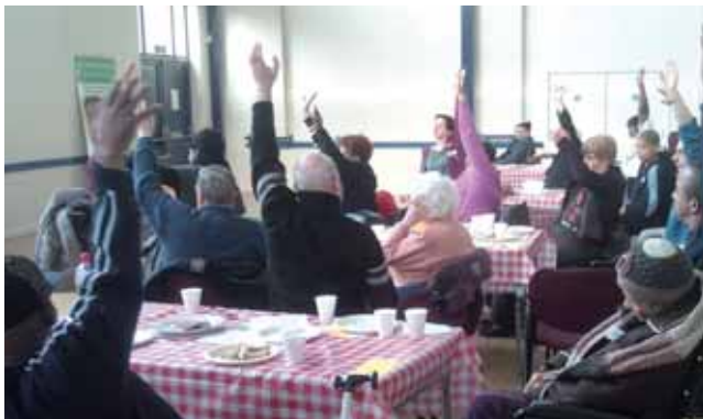
Hands up for The Stroke Project conference