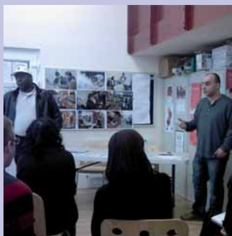
Workers advice debut at Day-Mer

H ackney Unites is a diverse coalition of Hackney-based groups and individuals that have come together to challenge social exclusion and promote social justice.