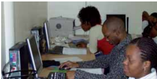
AJRAF: Job search support