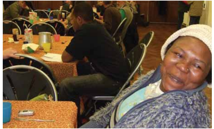
Guest at Hackney Winter Night Shelter

SPARK spoke to five voluntary and community sector (VCS) projects which provide an array of support to people who need accommodation in the borough.