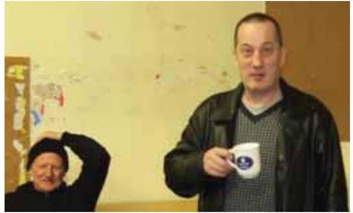
Guests at Hackney Winter Night Shelter

in Stamford Hill. We set up a once weekly outreach satellite service at the church targeting homeless Central and Eastern European (CEE) nationals who were street drinking on Stamford Hill and Upper Clapton. The service enabled 75 CEE nationals to access the Greenhouse for healthcare, obtaining ID, NI numbers and employment support. An additional part of the outreach project included co-ordinating the response to the closure of a local squat.