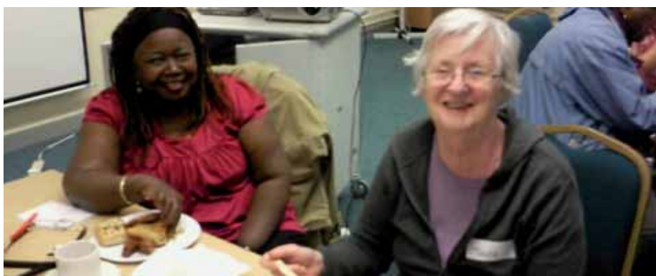
Disability Backup members celebrate at first year party

Disability Backup Forum celebrated its first year of meetings in October. The forum is a local consultation network between local disabled people and Hackney Council.