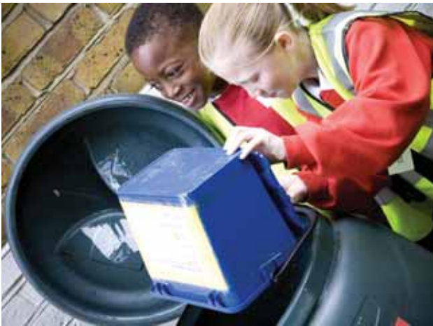
Picture of children taking part in local environmental group, ecoACTIVE's activities on composting in schools

CEN: Do you have knowledge of Hackney's environmental issues?