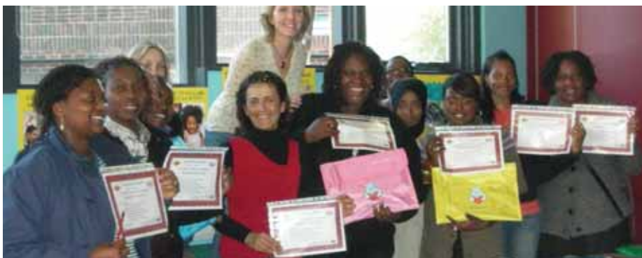
Hackney's latest storytellers with their certificates of achievement

T ranfusion Music took part in Hackney's Words Unite campaign this year with four weekly Storytelling and Book Reading workshops. Thirty-three parents and carers of children aged between 3 and 8 years old came along to Morningside Children's and Parents Centre, to improve their children's interest in reading and stories.