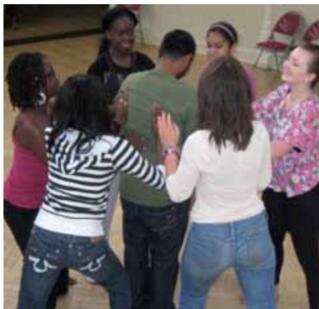
Acting up at ATC Theatre

ATC is a theatre company based at the Tab Centre, they will be running a series of performance skills workshops in early 2010 for local young people aged 14-25. To find out more about ATC and previous ACT@ATC workshops (including their Summer and October Half Term courses) visit www.atctheatre.com ♦