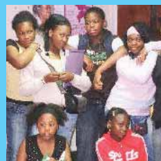
NEWS FROM THE SECTOR african arts project opens its doors

HCVS magazine for Hackney's voluntary and community sector