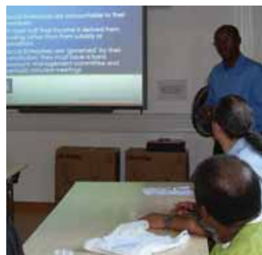
BEMA: Fighting fit