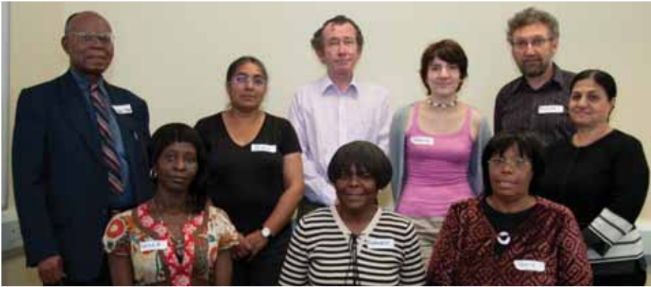
Local watchdogs on health: New LINK steering group

H ackney LINK, the borough's new watchdog for health and social care services, has elected a new team, pictured above, to lead it through the coming year.