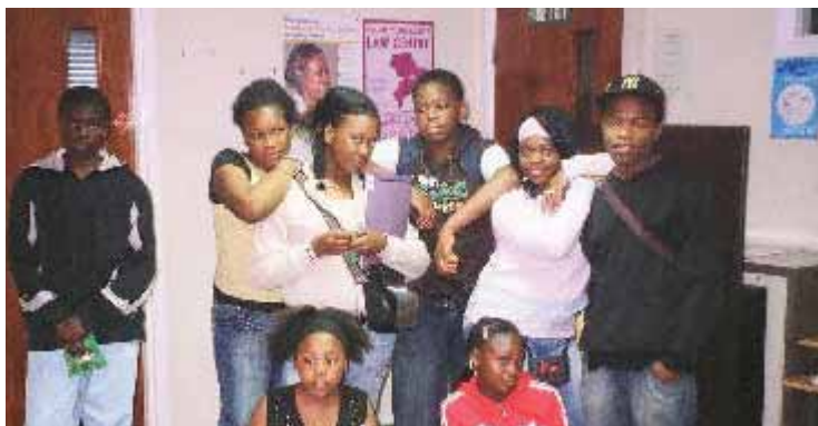
Young people at African Arts Project