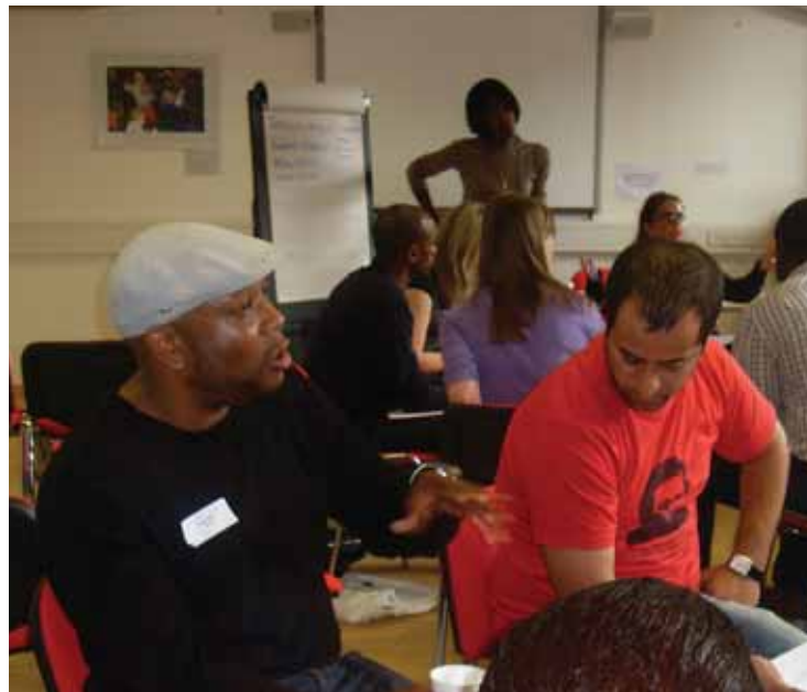
Youth crime consultation: Getting the view from the ground

CEN reps on Team Hackney's Boards and Sub groups and leads of community networks joined key officers from Hackney council for each discussion. At the worklessness review in May, this was extended to members of the Economic Development