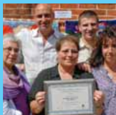
HCVS adiaha antigha community achievement award winners